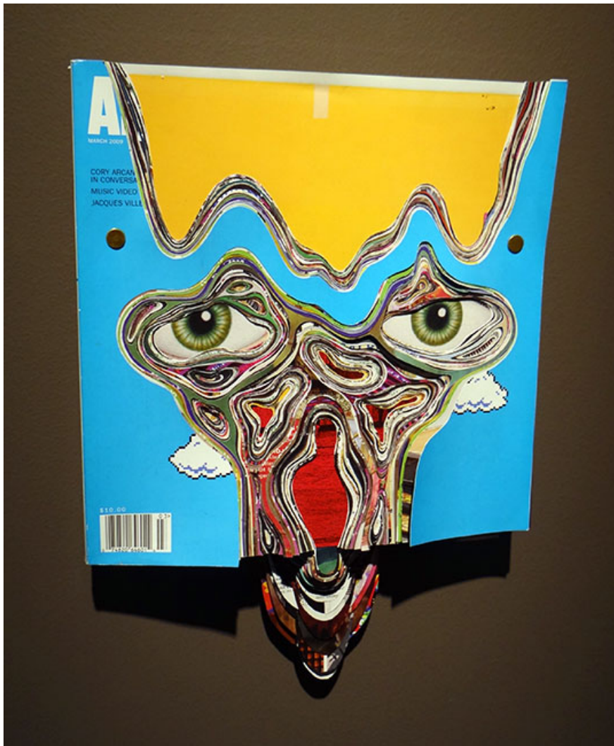
Artforum magazine art by Francesca Pastine at Eleanor Harwood Gallery.