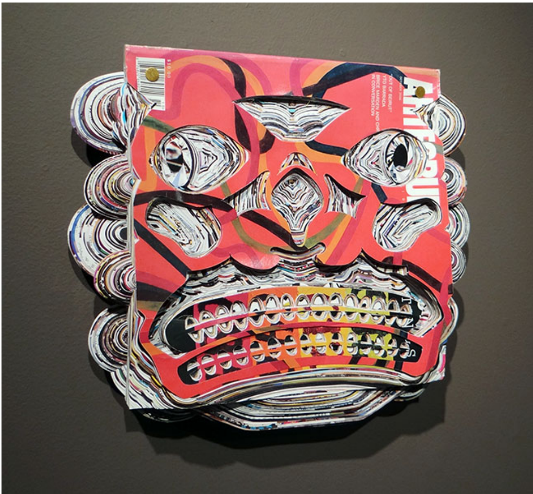
Cut carved Artforum magazine inspired by Northwest Coast tribal art.