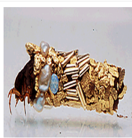
Notes from around the Web: