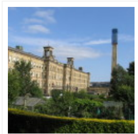
Antiquing in England: Saltaire