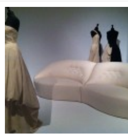
Charles James Exhibit at the