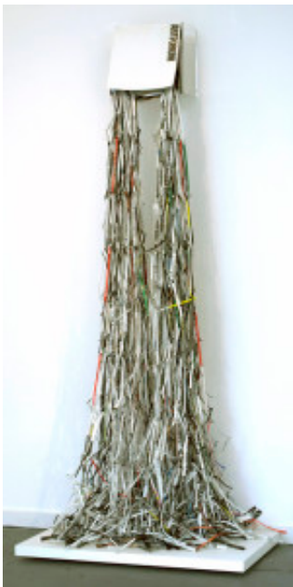
Artforum 43, Ghost

The excavations are always subtractive and, even when it appears that the magazine has jumped the confines of its form to drip and ooze, nothing has been added to each magazine but Francesca's vision. The works are complex, sometimes utilizing multiple copies of the same issue to explore themes and variations.