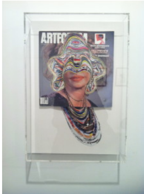
Artforum 47, Unsolicited Collaboration with Cindy Sherman

cultural reference in mind. Instead, she relies on her imagination and subconscious images of “masks” held in her mind’s eye. Through re-contextualizing and subverting the ARTFORUM magazine to her own ends, she conflates socio-economic and political conditions with her lived experience. In this way, she sees the masks as “power objects” that function in a similar way to ritual masks and totems. The original function of ARTFORUM as an authority of cultural production is thwarted and, instead, it becomes an object d’art that reads as a relic rather than a commentator.”