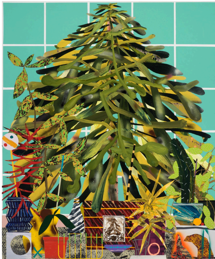
The Story Told is Not Always Yours to Know but Sometimes to Hold as a Thing to Wonder About Acrylic on canvas, 60" x 50"

San Francisco, CA. Aug 27th, 2024. Eleanor Harwood Gallery is pleased to present Paul Wackers' ninth solo exhibition with the gallery: If You Can't See Me, I Can't See You . The show will open on September 7th, 2024, and be on view through November 2nd, 2024.