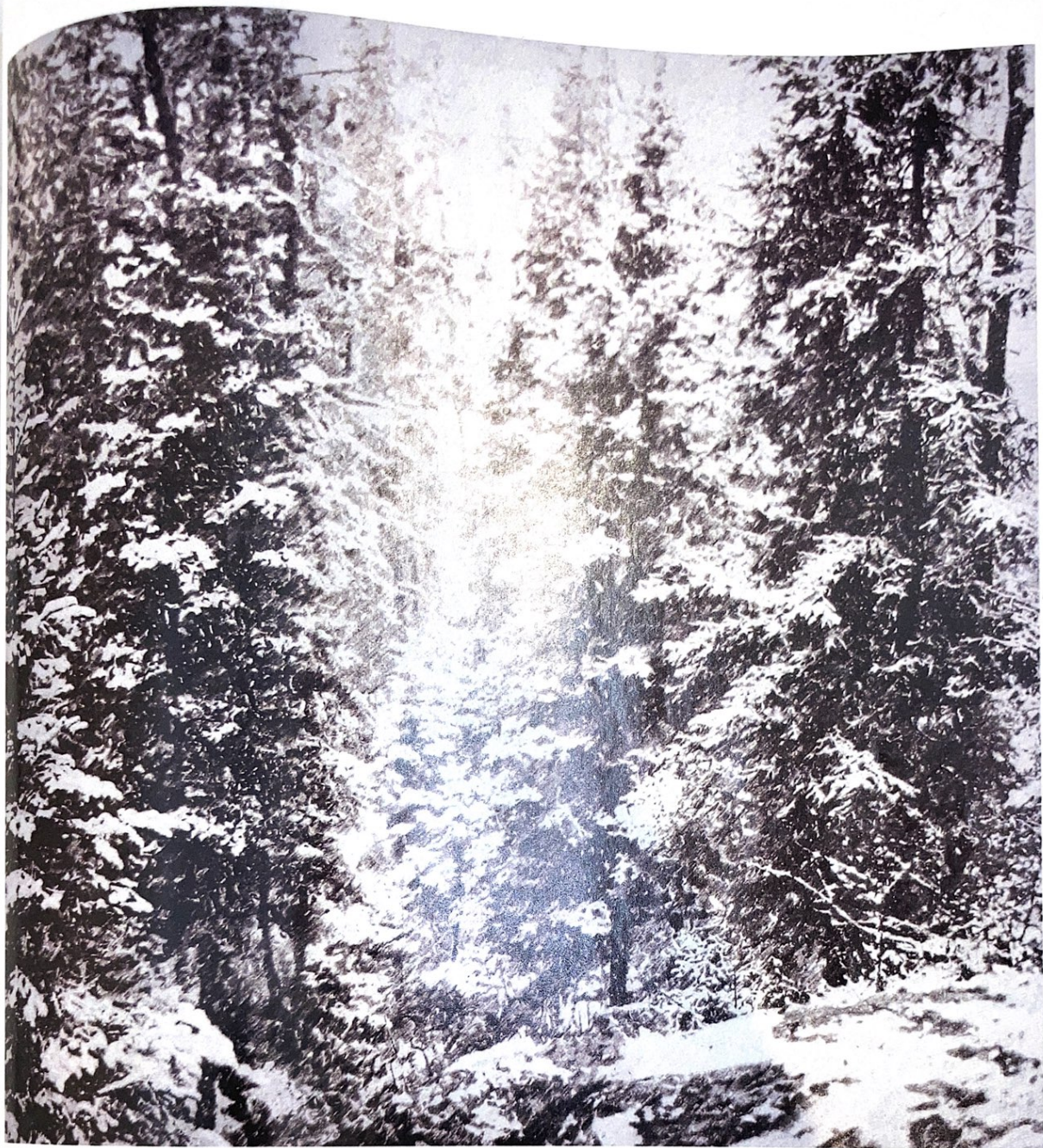
SNOWY FOREST, OIL ON CANVAS, 40 X 40"