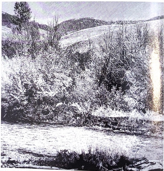
RIVER, OIL ON CANVAS, 40 X 40"