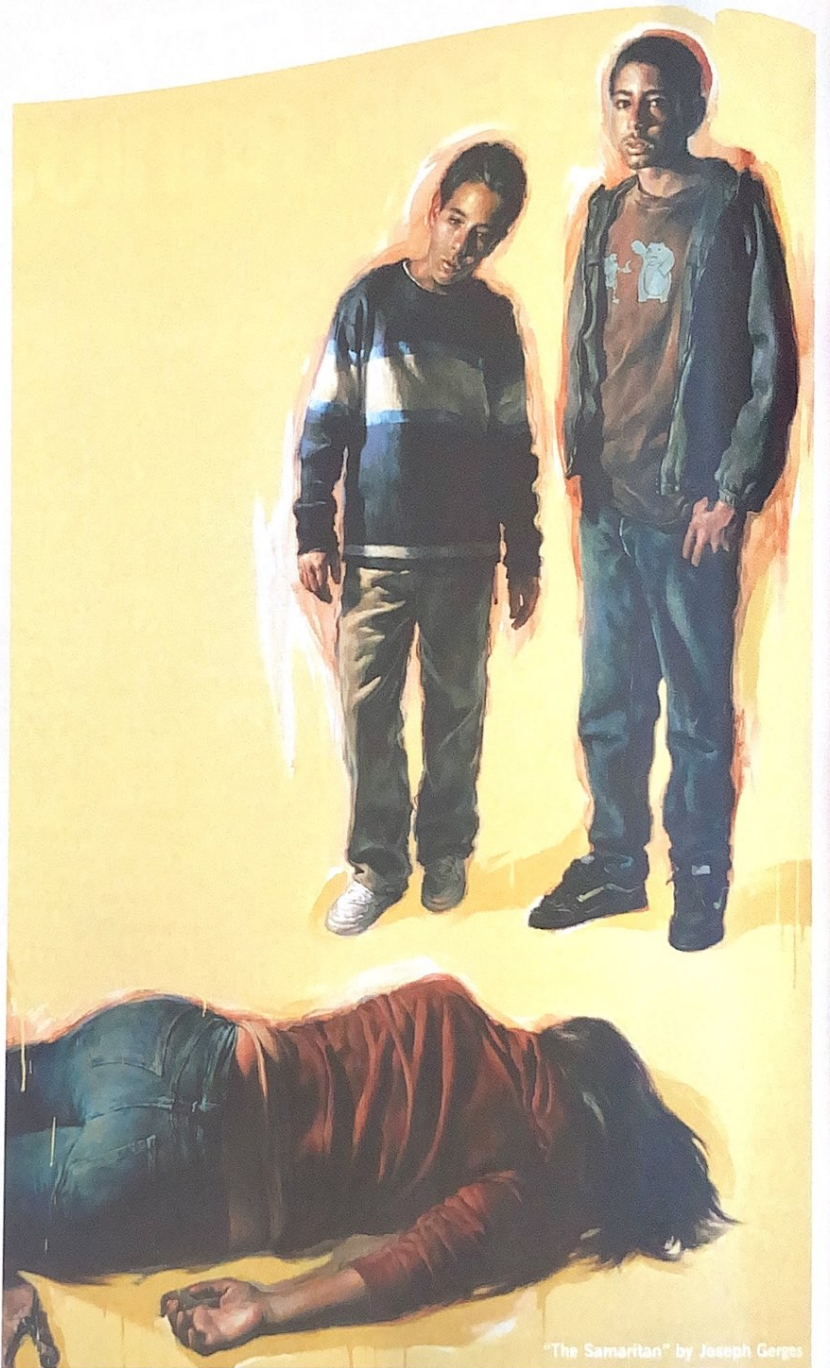
"The Samaritan" by Joseph Gerges

The force is strong with North Park's Thumbprint Gallery, which is presenting "That's No Moon," a one-night-only Star Wars art show/party at Bar Basic.