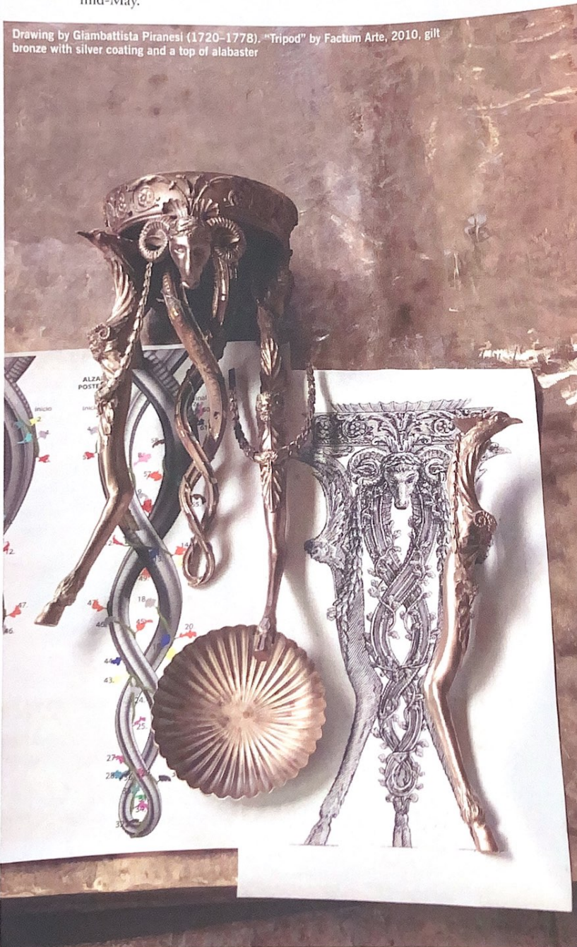
Drawing by Giambattista Piranesi (1720-1778). "Tripod" by Factum Arte, 2010, gilt bronze with silver coating and a top of alabaster