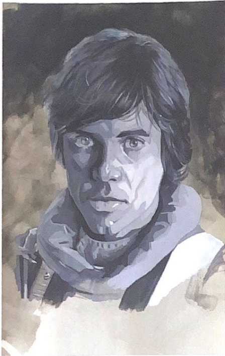
"Luke" by Rod Mojica