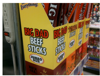
There's something not right about that. -as of 1pm