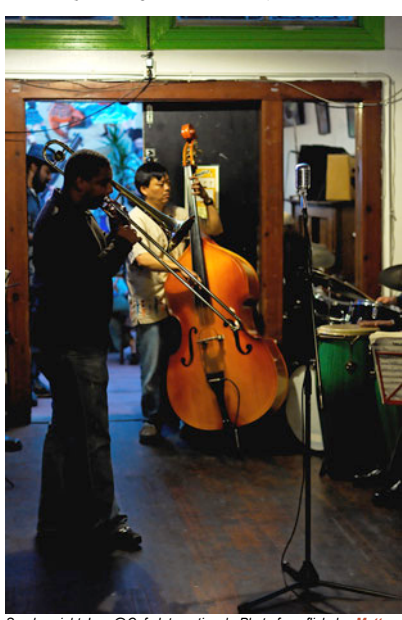
Sunday night Jazz @Cafe International - Photo from flickr by: Mat

We are so excited to be around such great food and cafes now since moving FFDG to the Lower Haight. Favorites are quickly amounting, but Cafe Du Soleil at Fillmore and Waller has such kick ass coffee and food... try the open-faced chicken sandwich & amazing ham and cheese croissant (just the right amount of ham).