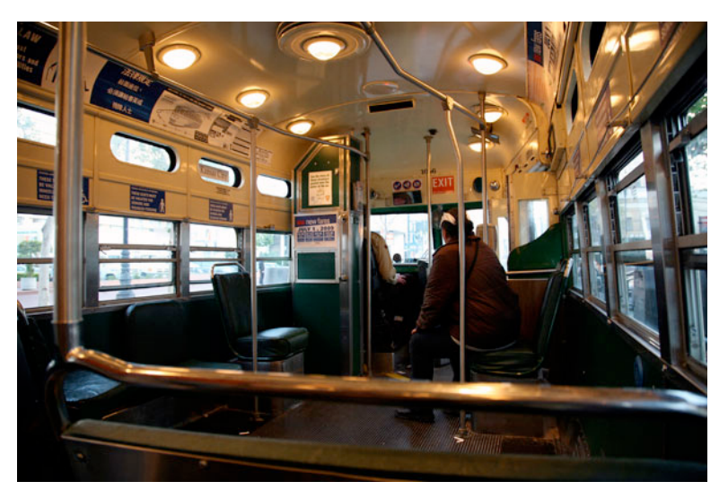
Jumped on the F and headed home.