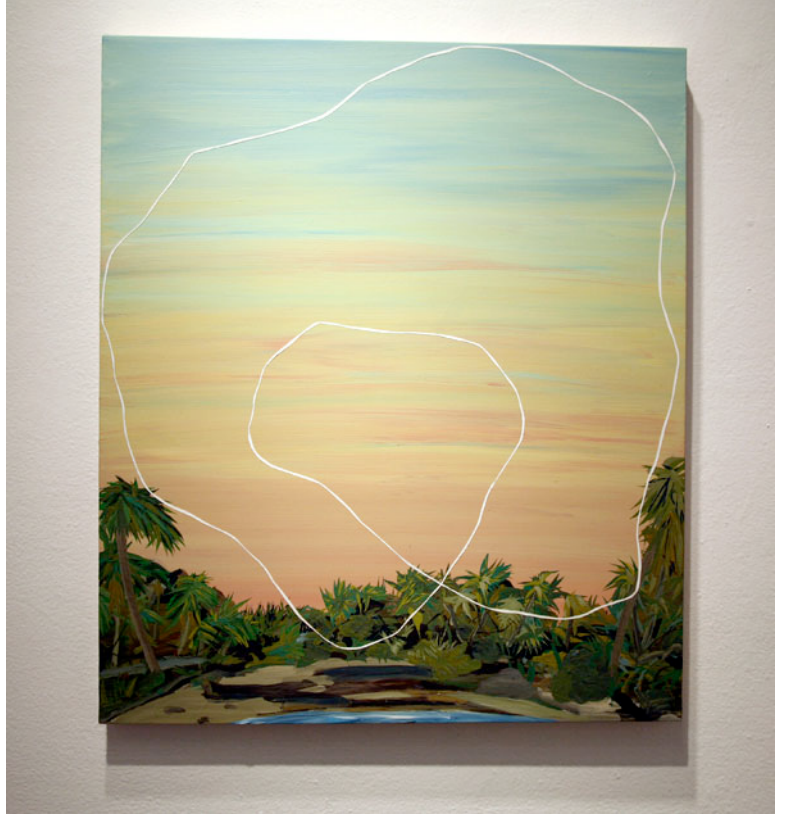
The floating ribbon reminds me of when cassette tapes came undone and you'd see them floating around in the air on the highway or fluttering from a tree or road sign. It had been a long while since I had seen this, but just that day at FFDG before heading to Mr.Wackers show I watched an old video ribbon dance between a tree and a light post. You may have seen the photos I posted on facebook from my iphone of it.