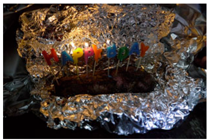
When cake doesn't suit you, it's steak thirty