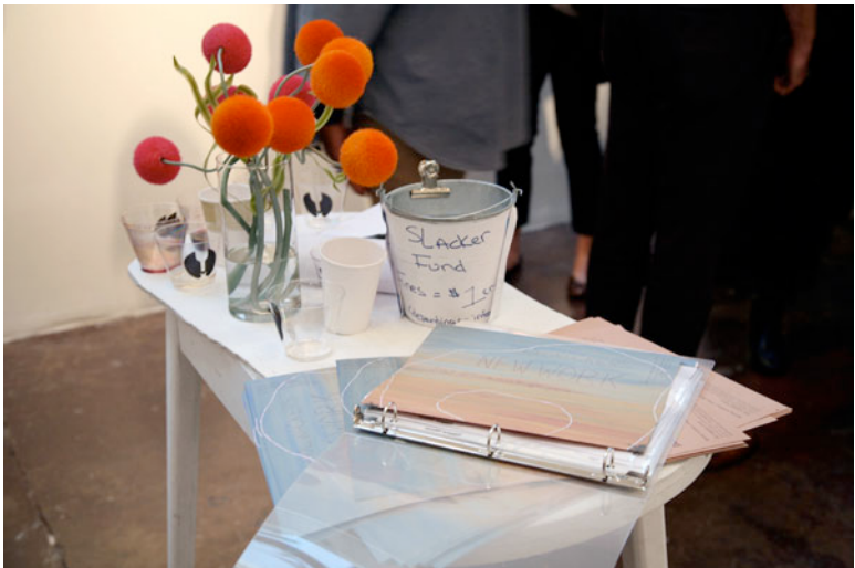
Haha, I need to get one of those...