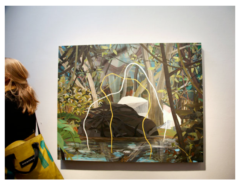
This was one of my favorite pieces from the show. I love all the elements with the water, trees, rock, and ground. The way the ribbons dance over the water is magical. And the ripples on the waters surface where the ribbons enter, makes me I feel like I'm there.