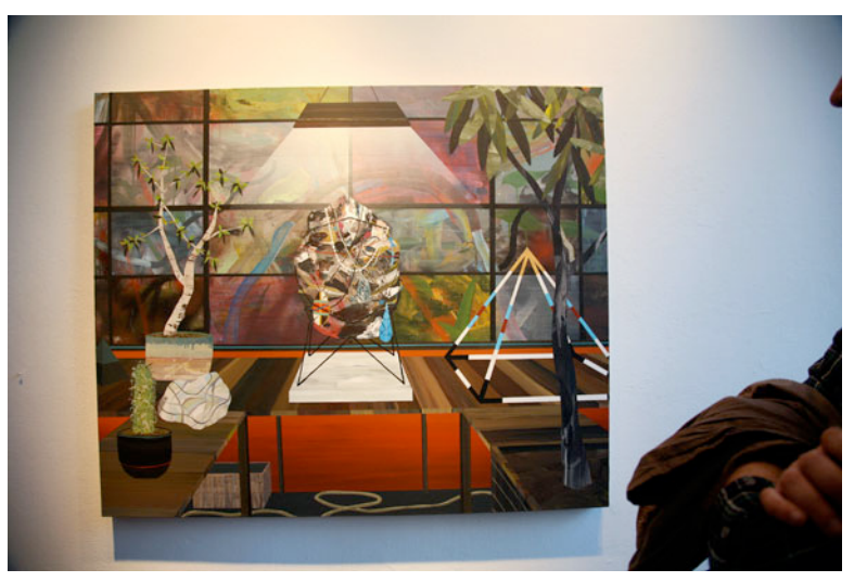
It's beautiful how the geometric shapes play and works with the organic, and then add all the colors. The colors bring such warmth and life to his paintings (or a coolness in some).