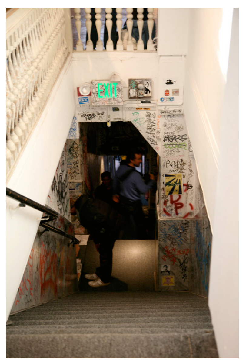
Headed out, but will hopefully be back to have another look before it comes down. The show was inspiring, not to be missed.