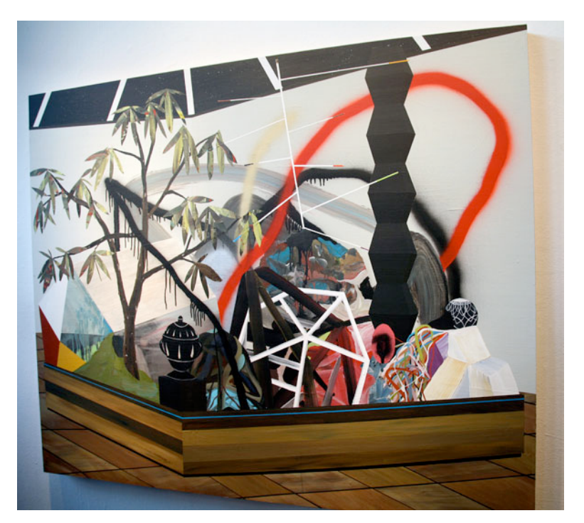
This being one of them. Incredible.